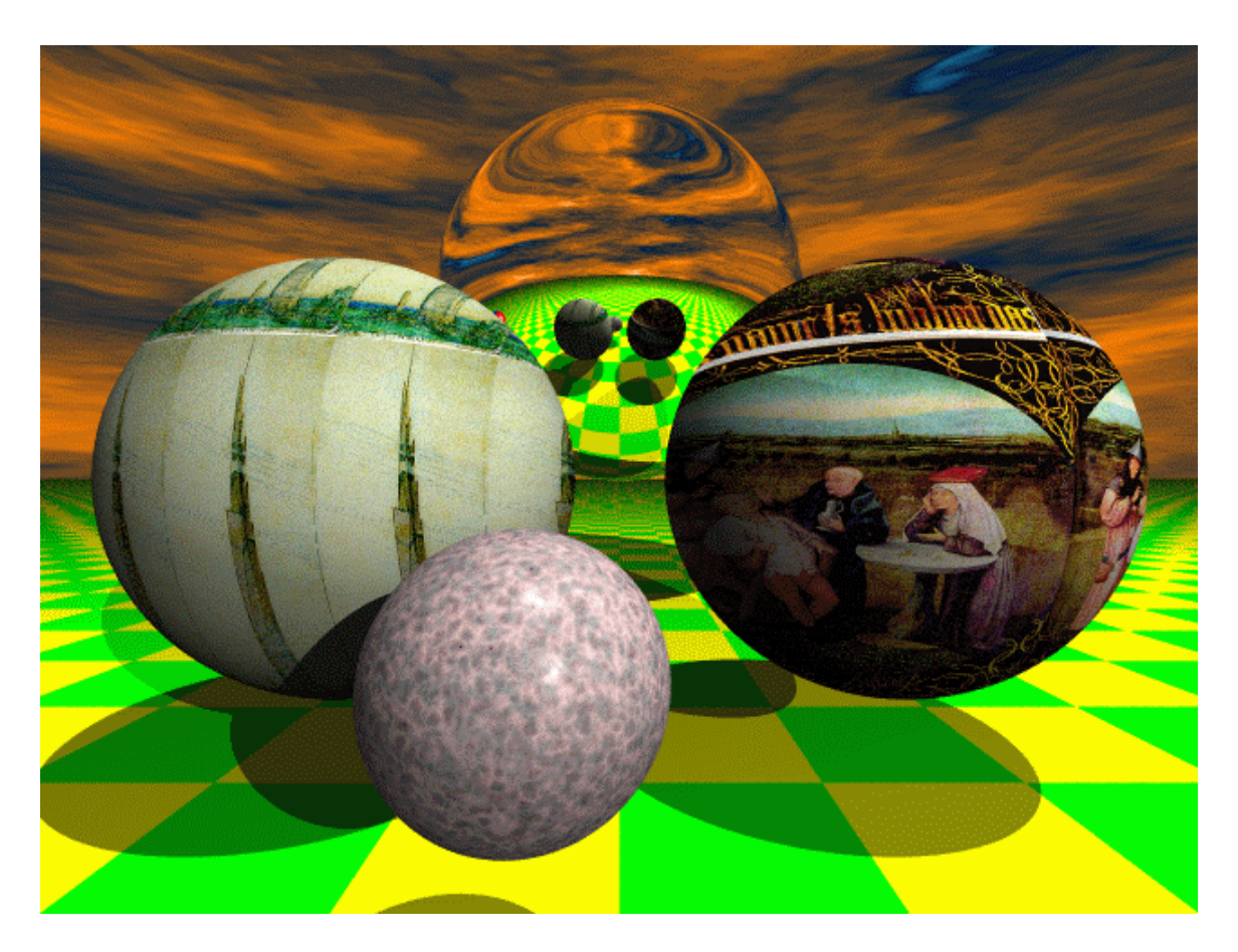
A sphere has the lowest surface-to-volume ratio of any three dimensional object

Objects that allow a user to control a large volume of complex machinery with a small, simple interface are more likely to flourish than those that don't. See THE SELFISH CLASS. An object with a simple interface relative to its internal complexity may be more likely to WORK OUT OF THE BOX.